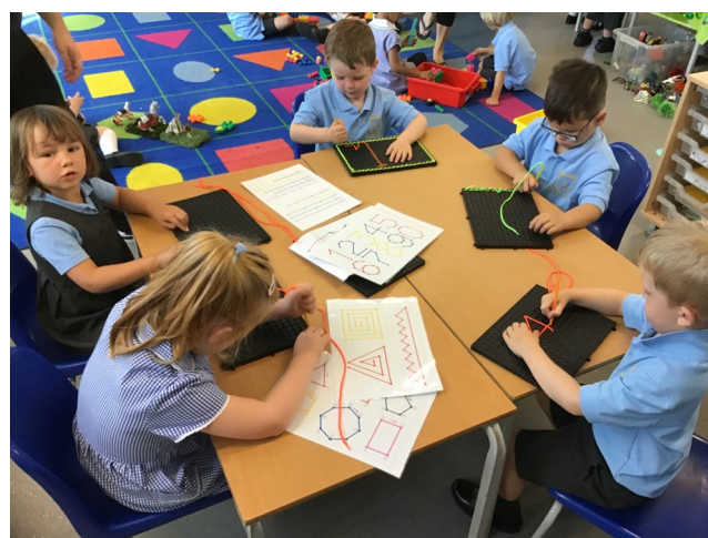
Exploring pattern and developing fine motor skills in Reception