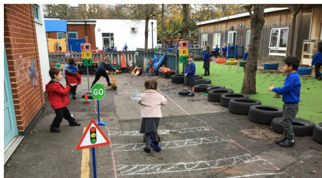
Reception road safety

We wish you a very merry Christmas and a happy new year!