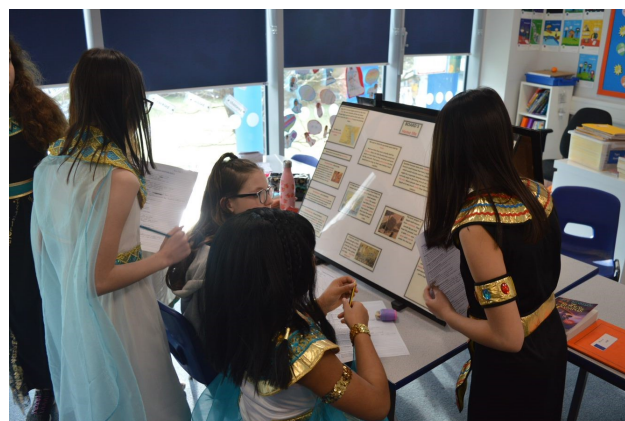
Y6 Egyptian workshop