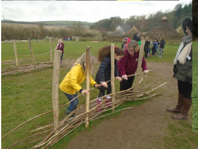
Y3 at Butser Farm