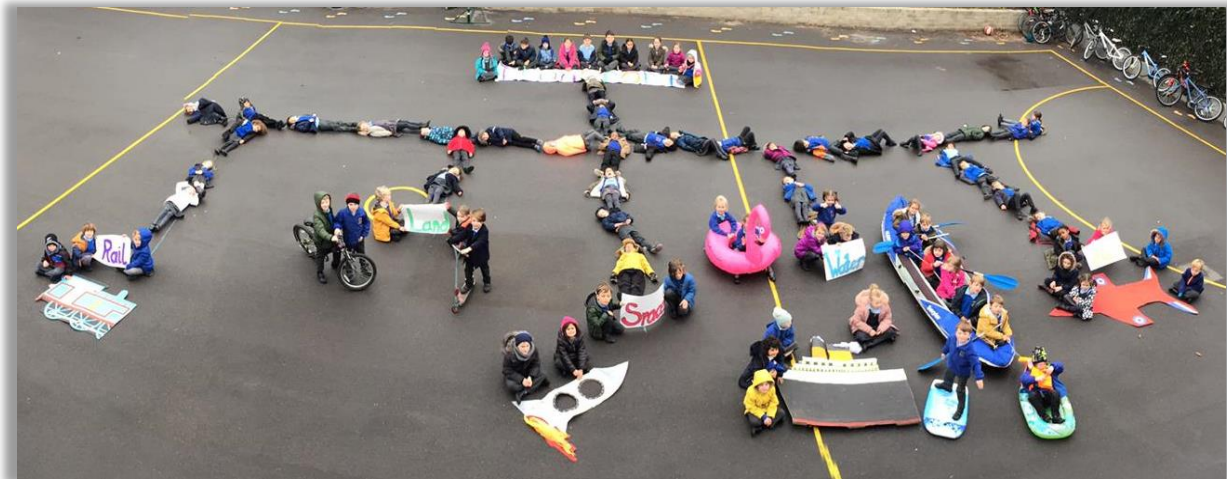
Year 1 Living Tree Map