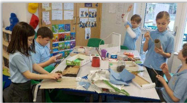
Year 4 pupils designing Anderson air raid shelters

As governors, we are tasked with ensuring that a rich, diverse and appropriate curriculum is taught throughout the school that taps into all children's natural interests. This is now a major focus of Ofsted. We consider this a major strength of ESPS and have never compromised our curriculum to try to achieve even higher results in Reading, Writing and Maths.