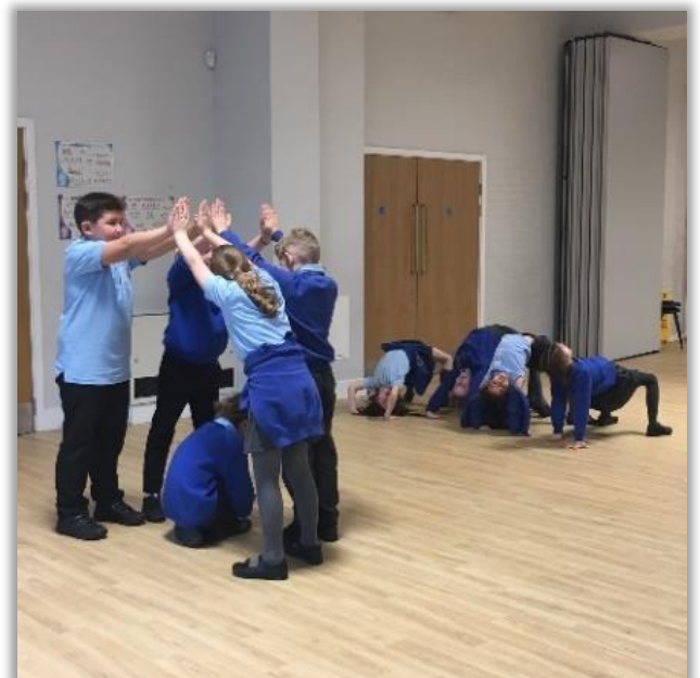
Year 4 creating more Anderson air raid shelters!

Strong emphasis is placed on the importance of history, geography, art and design technology, computing* and physical activity, which together demonstrate the foundation of primary school learning. Such enriching subjects and focus areas enable children to build on their prior knowledge and understanding and develop skills to equip them for life beyond primary education.