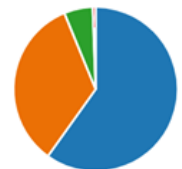
My child is happy at this school (0 point)